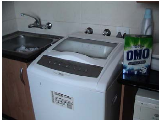
Washing machines were a bit different looking. Dryers typically did not vent to the outside.