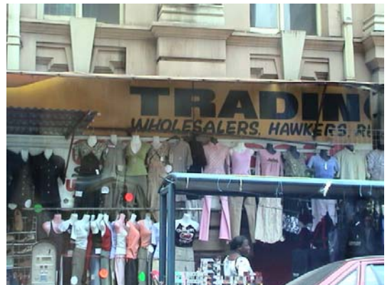
Shopping and bargains galore.