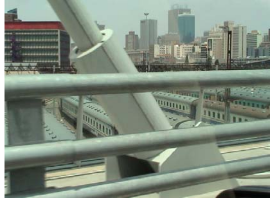
Johannesburg has skyscrapers and is a rather large city. Parts of the city are not considered very safe for tourists however.