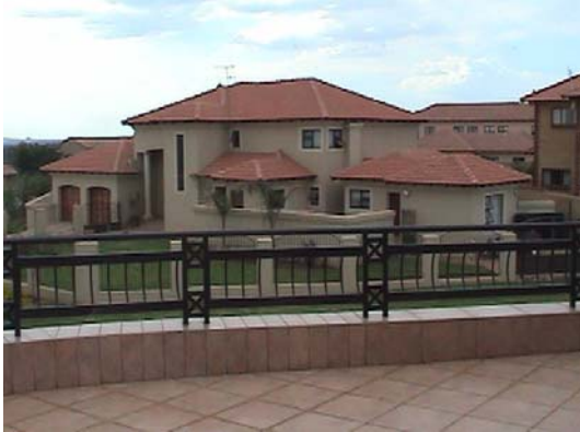
Some of the homes I saw were huge and quite impressive, most were masonry construction with lots of brick and tile.