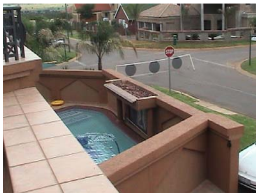
Gardens and pools were very popular.