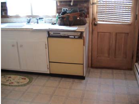
Remember Harvest Gold Appliances? Some houses still have this and Avocado green.