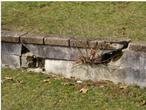
This retaining wall is going to require replacing.