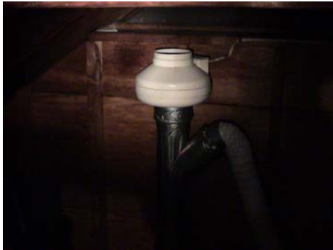
A fan in the attic can draw the moisture and odors out of multiple bathrooms, but not venting it to the outside really leaves the job unfinished.