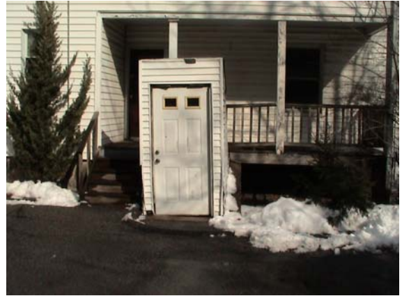
A pretty grand entry to get to the unfinished basement.

Know someone looking to buy a home? Tell them we'll get them the best home inspection services. If we don't serve their area, we will refer a great home inspector who can help. We promise to help your friends with the most important purchase of their lives!