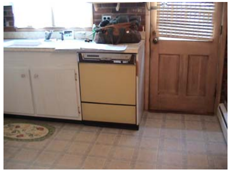
Remember Harvest Gold Appliances? Some houses still have this and Avocado green.