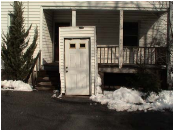
A pretty grand entry to get to the unfinished basement.

Know someone looking to buy a home? Tell them we'll get them the best home inspection services. If we don't serve their area, we will refer a great home inspector who can help. We promise to help your friends with the most important purchase of their lives!