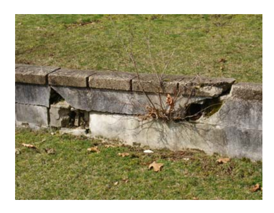
This retaining wall is going to require replacing.