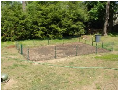
Spring is here, and we are getting the soil ready for the vegetable garden.

Do you remember to close the umbrella when you are not using the backyard table? I'm still cleaning up the glass from the last wind storm where the top shattered. I wasn't surprised that a new glass top costs more than the whole table originally cost.