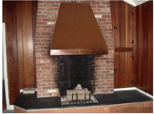
When it comes to fireplace safety...there's not too much here. This hood was silconed into place with a damper mounted inside with a chain to open it.